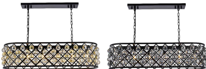
Matte Black Item No:1216G40MB-GT/RC